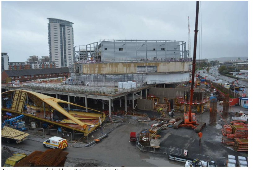
Arena waterproof cladding. Bridge construction

Delivery of outputs likely to be affected by Covid-19